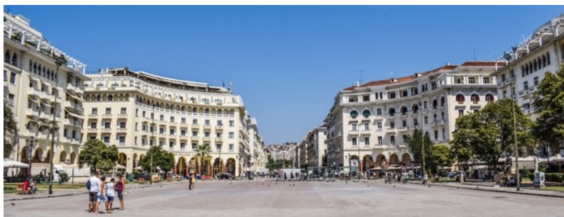
Winter EDM Thessaloniki 2018